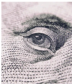
CRYPTO TREASURY MANAGEMENT