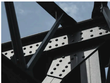
A MORE RESILIENT PROJECT