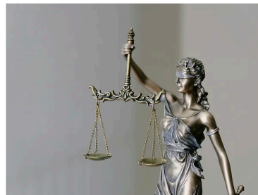
REDUCED REGULATORY RISK