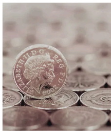
TOKEN SALES PROGRAMS